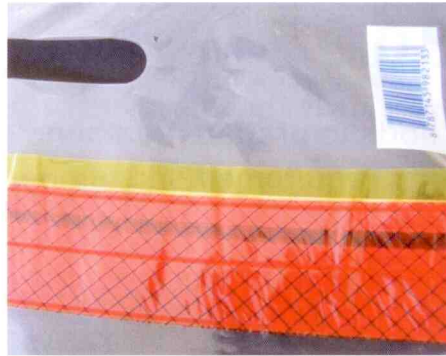
Security tape on a duty free bag

For this purpose the Wehr-based adhesive specialists recommend UV curing hot melt adhesives from their Novarad RC series, which works on an acrylate basis, to their customers. They are a proper substitute for acrylate and solvent based adhesives and help reduce the solvent emissions to a great degree. At room temperature the Novarad adhesives show a honey-like consistency. These are liquefied in barrel melters and, according to their final application, brought to a working temperature of 120-140°C, at which point they are processed by roller or nozzle coating systems. After the coating they are UV cured. For void tapes on