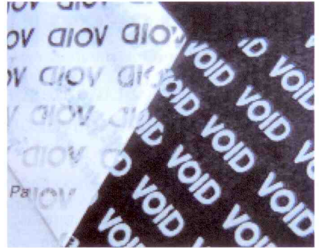
A void label with glue leftovers

In their self-adhesive form they can also be helpful in logistics to track luggage at airports or to collect